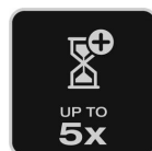
Up to 5 times longer lifetime3)

See and be seen with OSRAM. Cool white color temperature similar to daylight. For more safety on the road, especially when driving at night