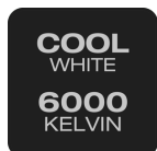
6000K & Cool White

The NIGHT BREAKER LED family - OSRAM's first street-legal1) LED retrofit lamps.