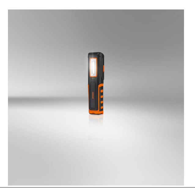
Light is versatile

This high-quality inspection light from OSRAM is perfect for professional and private use. With two light functions - main light with up to 500lm and torchlight function with up to 100lm, the appropriate light output can be retrieved depending on the task. While some inspection lights take up to three hours to charge, the FAST CHARGE PRO 500's fast charge function takes the lamp from 0% to 100% battery charge in just about 1 hour while still offering a long service life. The inspection light is rechargeable, and the integrated charge level indicator shows the current state of the battery. A USB Type-C charging cable and the corresponding power adapter are included in the scope of